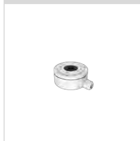
DS-1280ZI-XS Junction Box