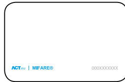
Product MF10C1 MIFARE CARD (pack of 10)