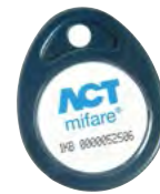
Product MF10T1 MIFARE FOB (pack of 10)