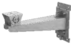
DS-1707ZJ-Y-AC (OS) Wall Mount