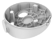
DS-1281ZJ-DM27 Inclined ceiling mount