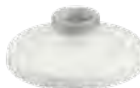
SBP-187HMW / SBP-187HM