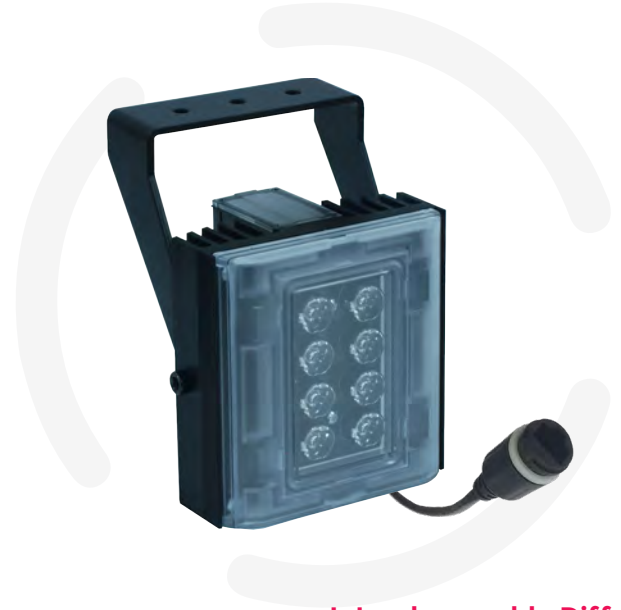
Interchangeable Diffuser Lens

As standard the illuminator includes interchangeable lensing to deliver 10° circular, 30°, 60° & 95° elliptical beam profiles.