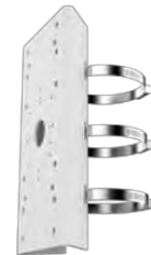
DS-1275ZJ-SUS Vertical Pole Mount