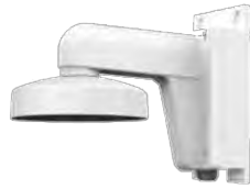
DS-1273ZJ-130B Wall Mount