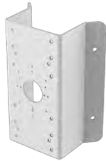
DS-1276ZJ-SUS Corner Mount