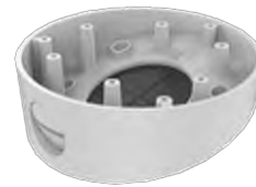
DS-1281ZJ-DM23 Inclined Ceiling Mount