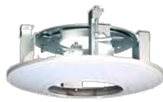
DS-1227ZJ In-ceiling Mount