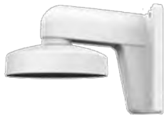
DS-1273ZJ-130 Wall Mount