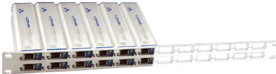
Up to 24 LONGSPAN units can be mounted in a 1U rack space.