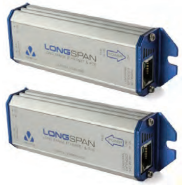
Example 1. LONGSPAN BASE and CAMERA are sold separately.

For network-only applications, the same non-POE model is fitted at each end of the link. For network and power delivery, Base and Camera POE units are used together. A POE switch or separate POE injector may be used as the Base power source. Maximum power and range is achieved with the optional 57V Veracity PSU, enabling the LONGSPAN Base unit to become the POE injector for the link.