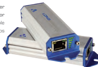
Example 2. Smart LED display shows SafeView™ technology.

NOTES: Range is for typical 24AWG Cat 5e or 23AWG Cat 6, 4-pair UTP | For other cables types, or any installations over 600 metres length, consult Veracity for recommendations or test on site | Distances may be increased by connecting multiple links in series | Datarateatfullrangestated:100Base-T=200Mbps, 10Base-T=20Mbps