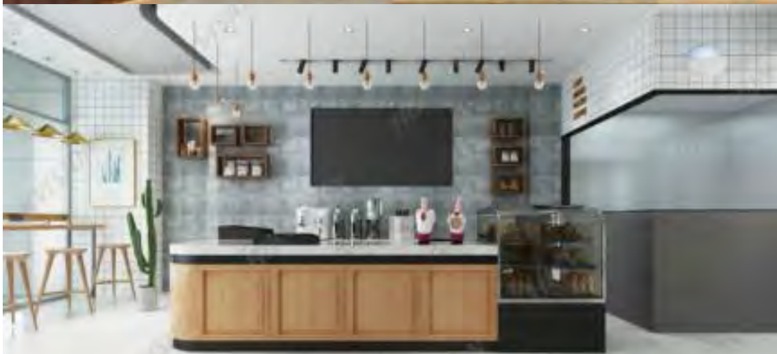
连锁门店广告展示相较于液晶显示器 无缝高亮展示 Chain stores advertising display, compared to LCD display, seamless highlighting